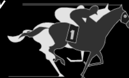
CSCT/CPCA Holiday Derby